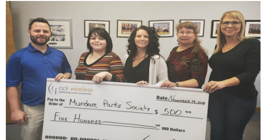
Mundare Parks Society receives proceeds from Wired internet promotion.

The town of Mundare has been raising money to build an outdoor pickle ball court for the community, led by the local Parks Society. Pickleball is a paddleball sport, like racquetball, that combines elements of tennis, badminton, ping-pong and table tennis. Two or four players use solid paddles to hit a perforated polymer ball, like a Wiffle Ball, over a net. It's played inside or outdoors on a badminton-sized court with a slightly modified tennis net. This sport has been gaining popularity as it is accessible for people of all ages and skill levels.